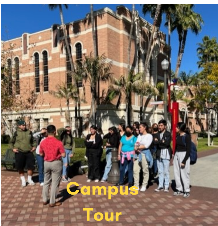
Wilson HS Visits USC

Team College organized a trip to USC. On February 9th, nearly 60 of our Wilson scholars toured the USC campus. More and more of our students are taking advantage of these opportunities. This is why I believe the college going culture at Wilson HS is so dynamic.